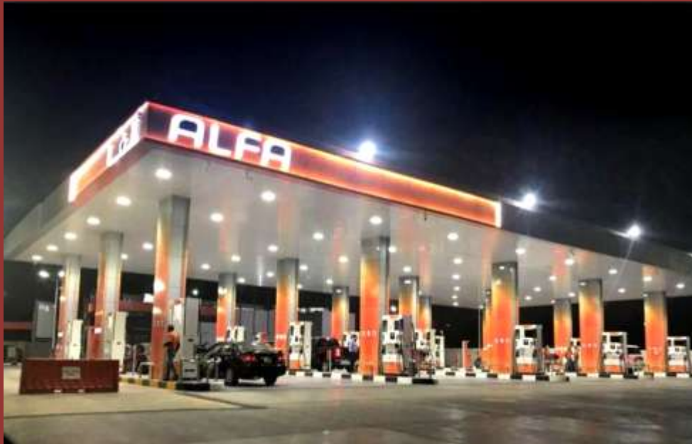
National Guard Society 2018