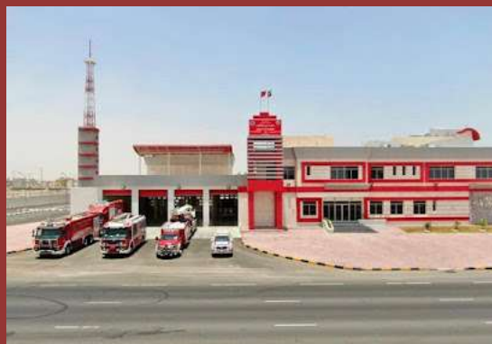
Jaber Al Ahmed Fire Station